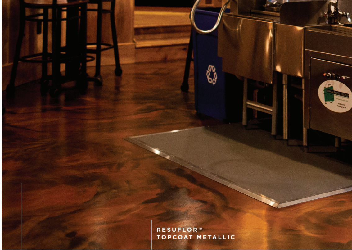
RESUFLO TM TOPCOAT METALLIC