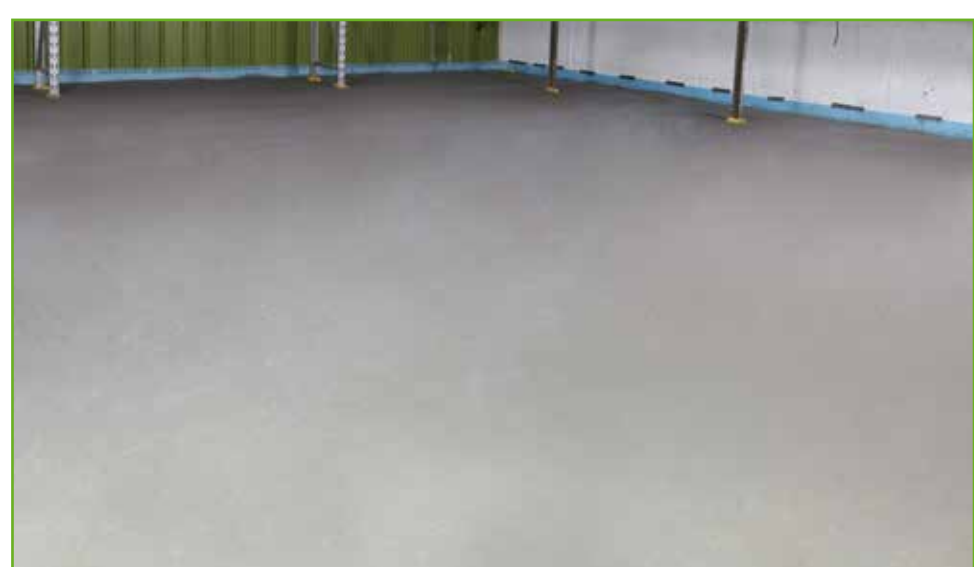
The result: a fast-setting underlayment that provides a smooth, level surface