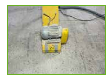
1. Substrate preparation